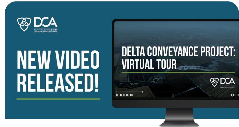
Click on the prompt to watch the video