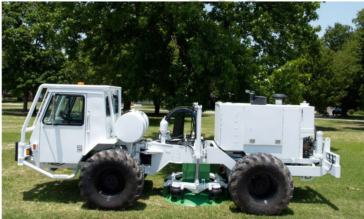
Figure 3. EnviroVibe Minibuggy.