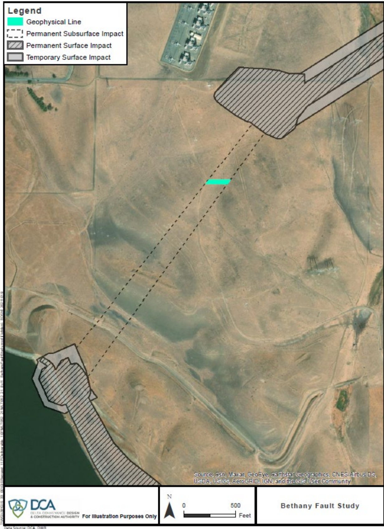
Figure 4. Geophysical Survey at Bethany Reservoir Aqueduct