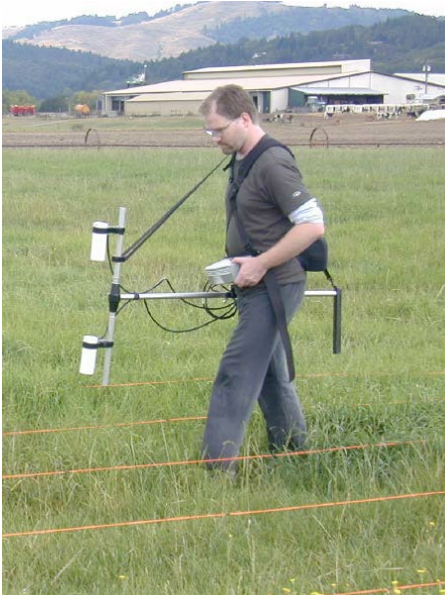
Figure 1. Cesium Vapor Total Field Magnetometer.